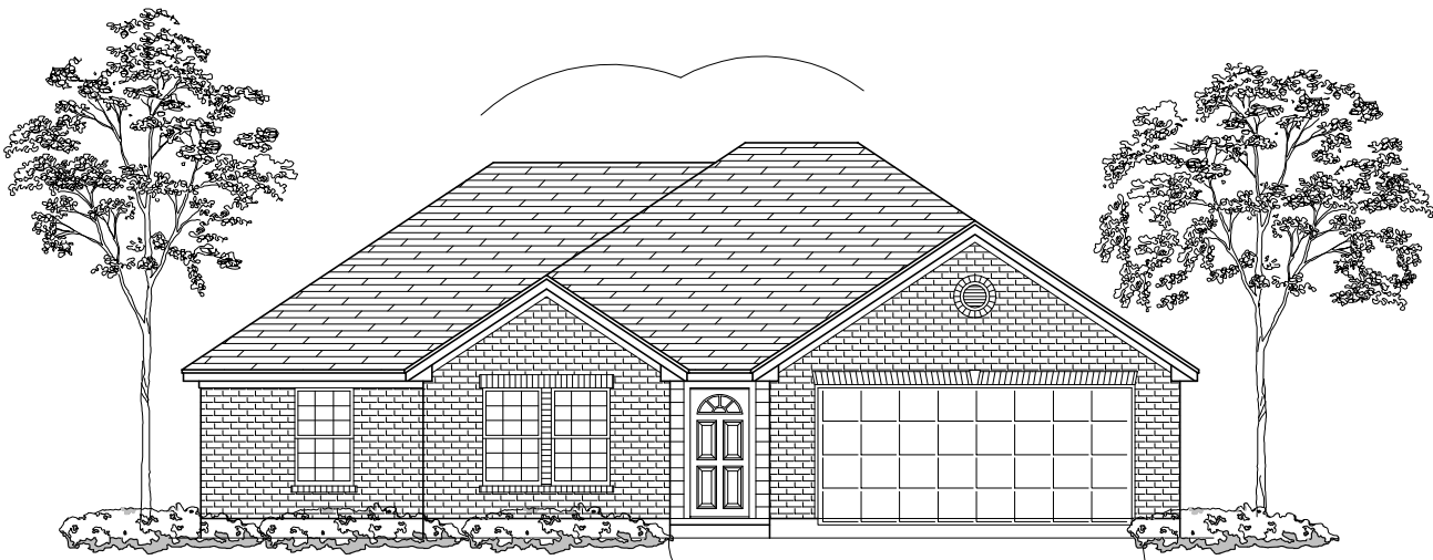
FRONT ELEVATION - PLAN: 1870