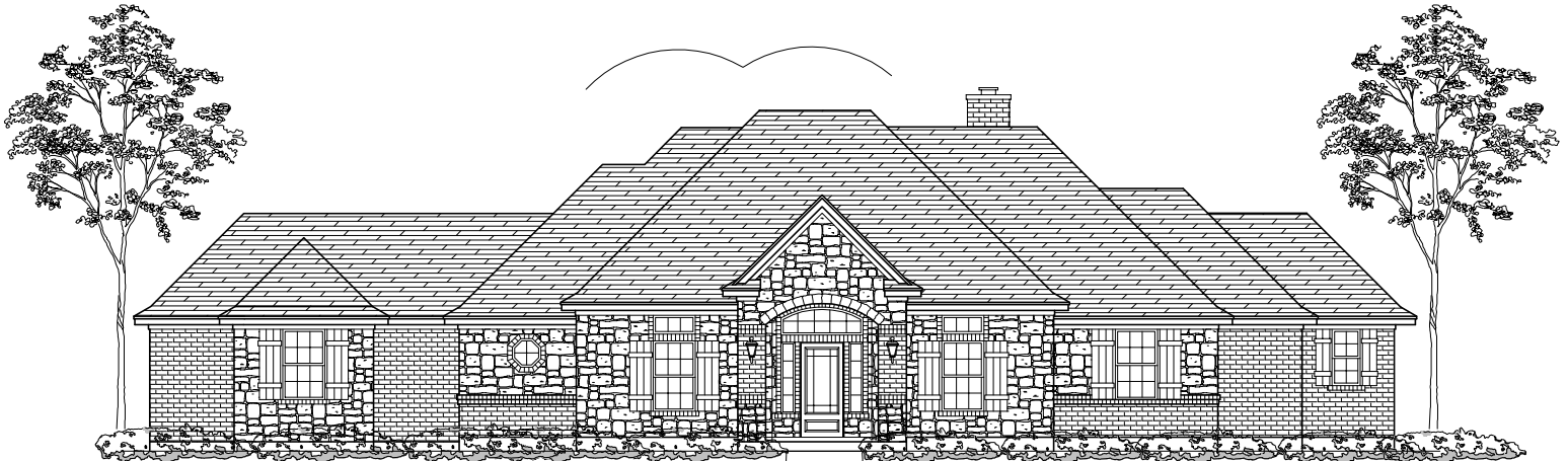
FRONT ELEVATION - PLAN: 2392 STONE - OPTIONAL UPGRADE