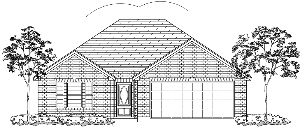
FRONT ELEVATION - PLAN: 1450