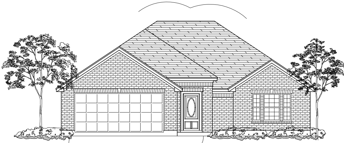
FRONT ELEVATION - PLAN: 1540