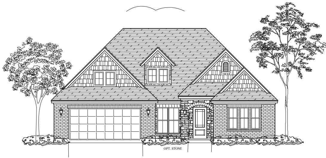
FRONT ELEVATION - PLAN: 2075